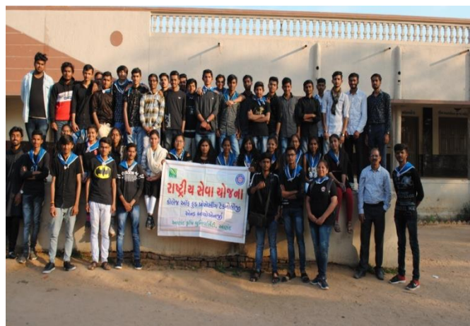
NSS volunteers team of FPTBE