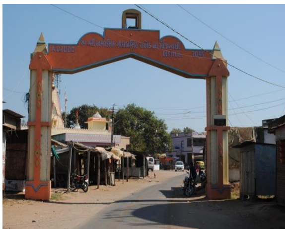
Main entrance of Khadol village

excitingly participated in the discussion and planned the road map for camp along with guided supervision of NSS Program Officer.